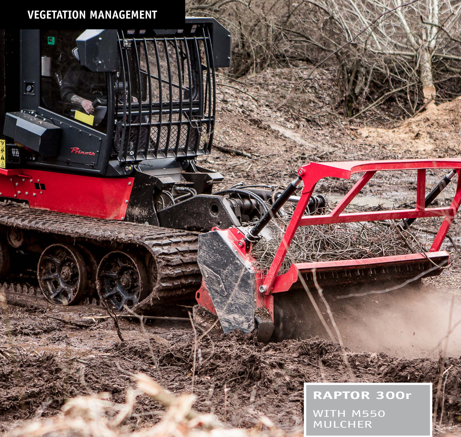
RAPTOR 300r WITH M550 MULCHER